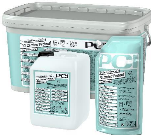
Impregnation PCI Zemtec Protect (link to high-resolution Photo )