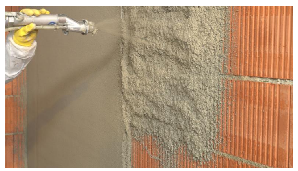
PCI Polycret 50 can be applied for a long time and is still fast setting. This makes it ideal for machine processing. (<u>Link</u> to high-resolution photo)