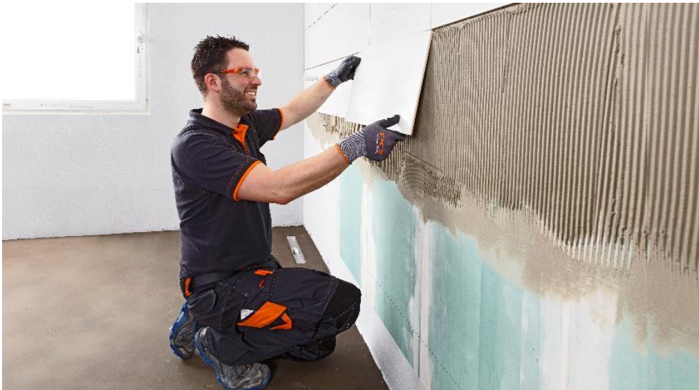
Large-format, heavy tiles can be fixed to the wall effortlessly and without slipping with PCI Nanolight. ( Link to high-resolution photo)