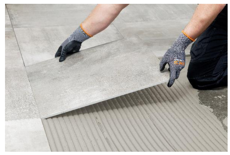
The new PCI Nanorapid fast-setting adhesive speeds up work processes and increases application convenience (<u>Link</u> to high-resolution photo)