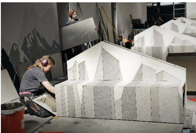
Impressions from the last PCI-Alpencup ( Link to high-resolution photo)