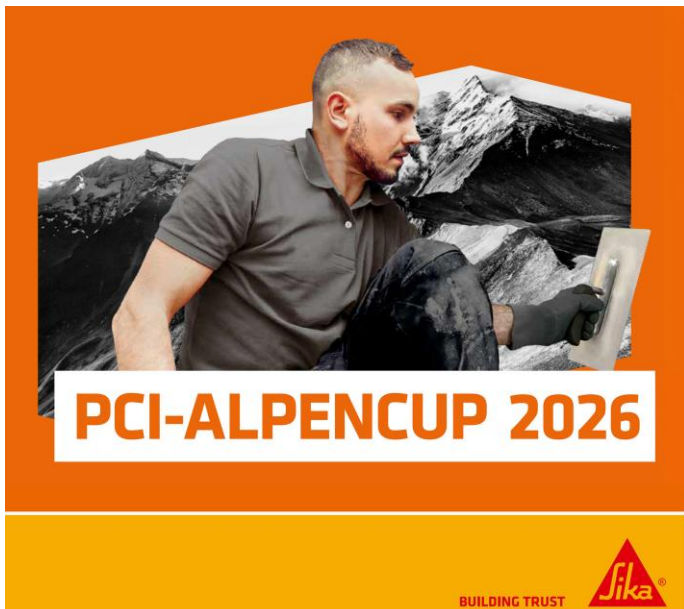
The fifth PCI Alpencup in Augsburg, June 25 to 26, 2026 ( Link to high-resolution photo).