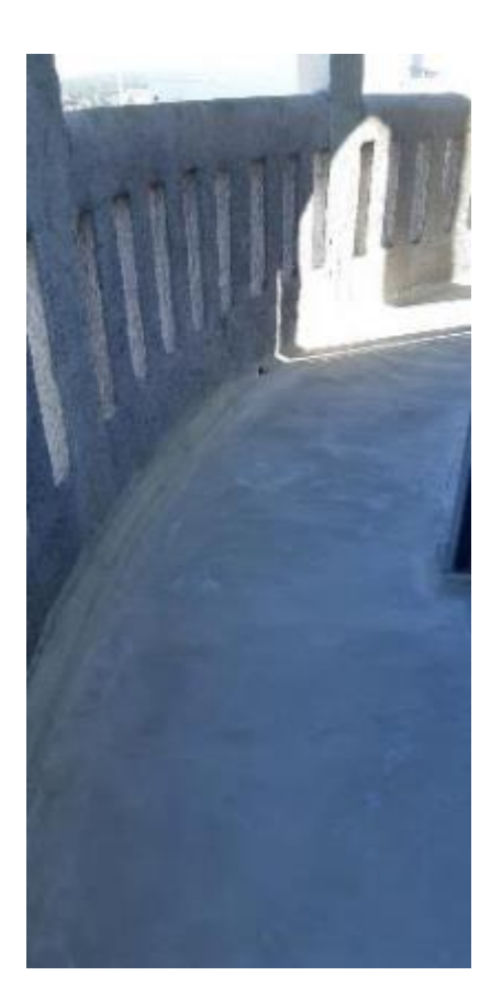
As a high-strength finishing coat, the craftsmen applied the fiber-reinforced repair mortar PCI Nanocret® R4 PCC. Link to high-resolution <u>Photo</u>