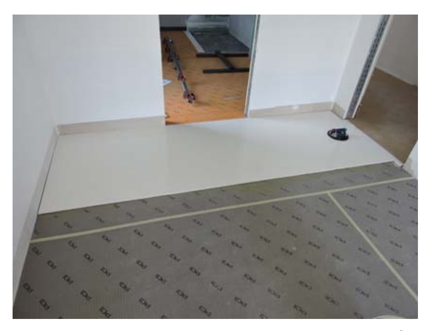
Fig. 7: To absorb stresses, the tilers installed PCI Pecilastic E insulating membrane with PCI Flexmörtel S1 Flott flexible adhesive under the tiling. The insulating and waterproofing membrane PCI Pecilastic U was used in the bathroom.

<u>augsburg.com:443/php/index.php?database=2&downloadimage=9454&size=4608x</u> 3456&format=&check=b50bfd54e271641543da4571fb94a255