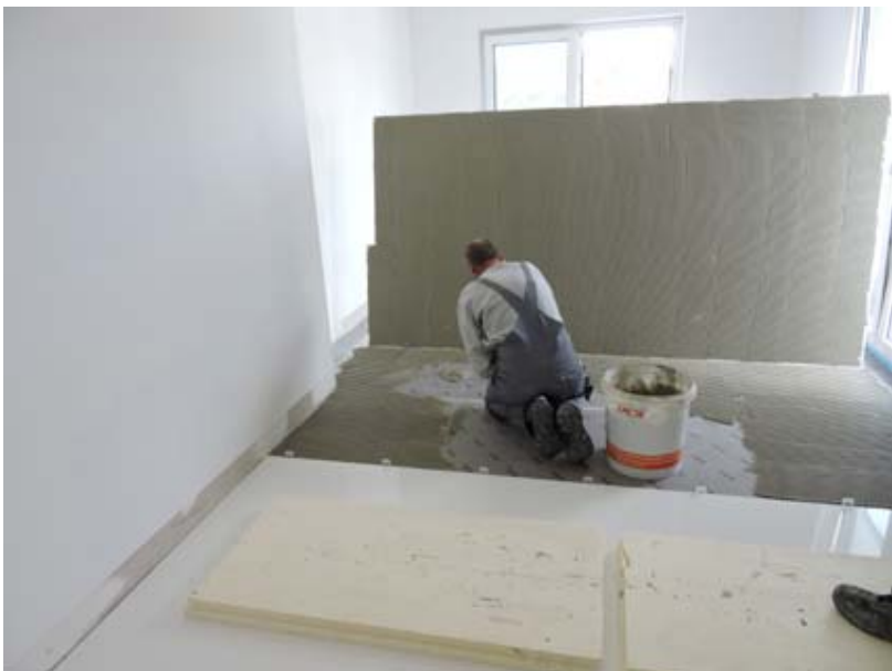
Fig. 5 and 6: To prevent voids to the greatest extent possible when laying the large fully vitrified slabs, the tilers applied the tile adhesive, PCI Flexmörtel S1 Flott, both to the prepared substrate and to the back of the slab.