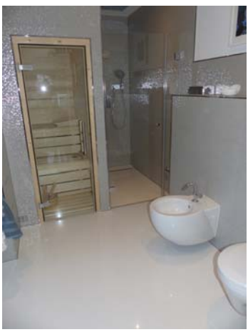
Fig. 3 and 4: The tilers covered about 40 m<sup>2</sup> of walls in the bathroom with 33 x 100 cm wall tiles.