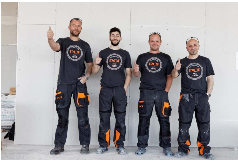
Fig. 7: Once again, PCI products have proved themselves in practice. The highly motivated tiling team is enthusiastic about PCI tile fixing products.