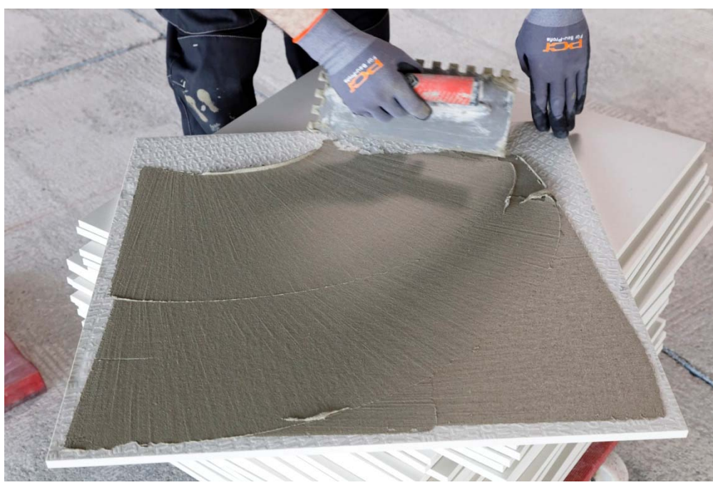
Fig. 4: Using the smooth side of the notched trowel, the tilers apply a thin layer of mortar to the back of the large tiles. Application of adhesive to the tile and the substrate prevents voids and makes for better bonding of the tiles to the substrate.