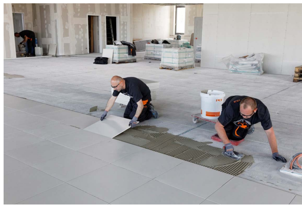
Fig. 5: After the adhesive has been applied, the tiles are positioned in the adhesive bed with a slight pushing motion and aligned.