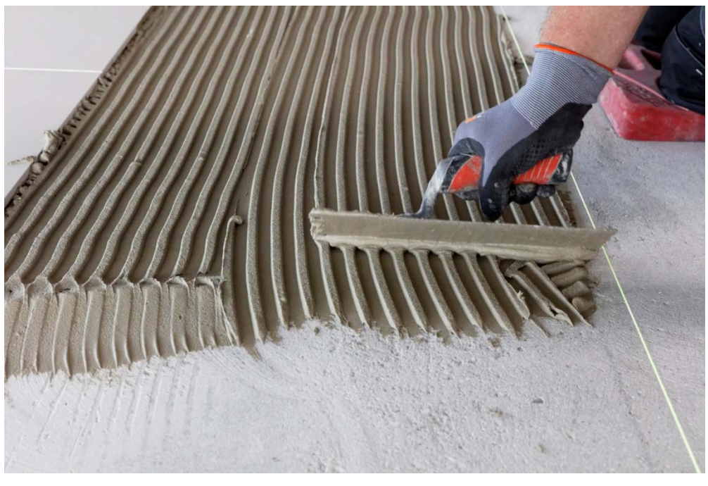
Fig. 3: The tilers apply PCI Flexmörtel S2 to the primed substrate using a notched trowel. Important: only apply as much mortar as can be covered with tiles within the specified working time.