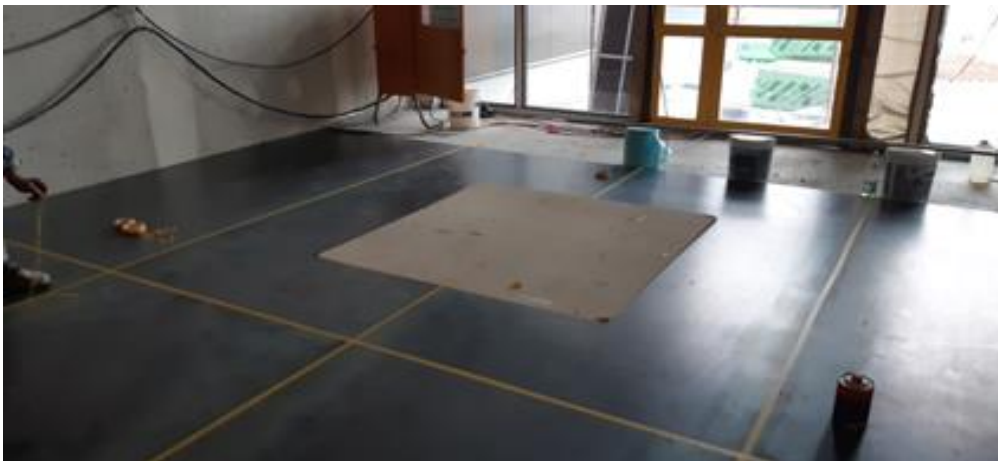
Photo 4 + 5: The steel slabs were laid with PCI Flexmörtel S2. The highly flexible mortar compensates for temperature fluctuations and substrate tension and has a very high adhesive tensile strength. For optimal adhesion of the tile adhesive to the back of the steel slab, it was primed with PCI Epoxigrund 390 and freshly sprinkled with quartz sand. The grouting was elastic with PCI Silcoferm S.