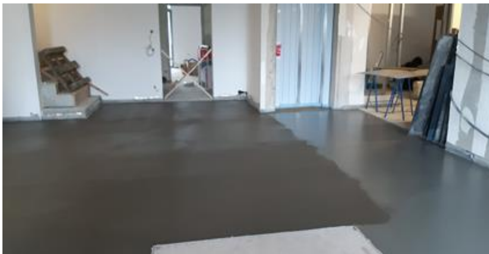
Image 3: The prerequisite for perfect execution for large formats is an absolutely even surface. Initially, PCI Gisogrund and the special filler PCI Periplan Extra were used. The surface was then filled with PCI Seccoral 2K Rapid.