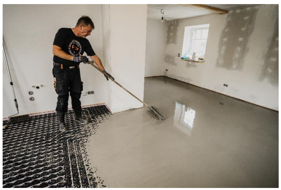
PCI Periplan Extra is self-leveling and therefore easy to work with.