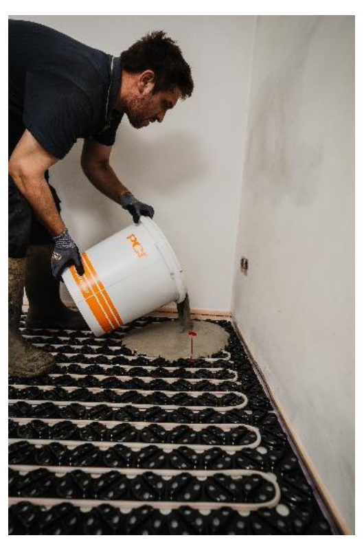
XPS insulation boards bonded with PCI Barraseal Turbo followed by the thin-layer underfloor heating only 17 mm high.