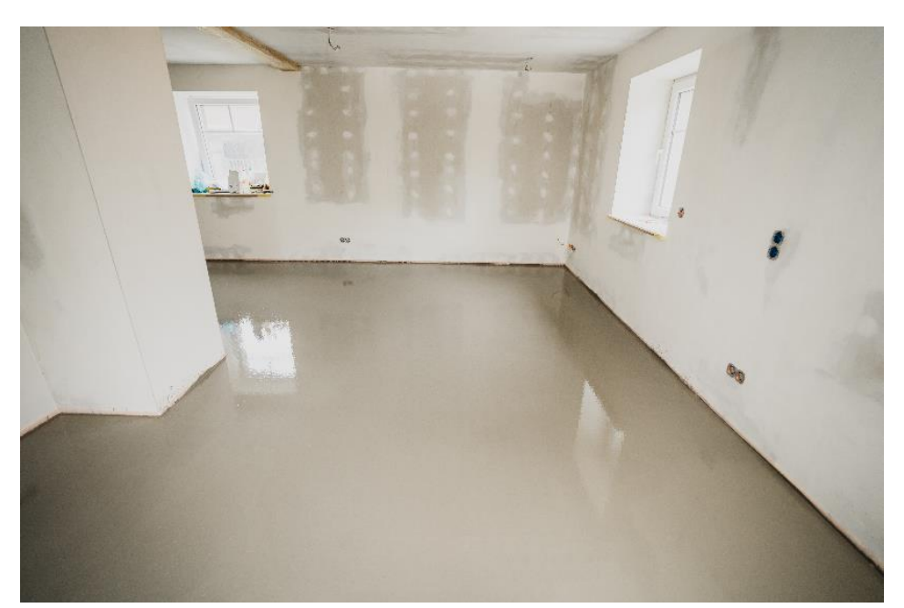
Ready for laying the vinyl floor after a short drying time: PCI Periplan Extra is suitable under textile and elastic floor coverings, is dust-reduced and very low in emissions according to GEV-EMICODE EC 1 PLUS..