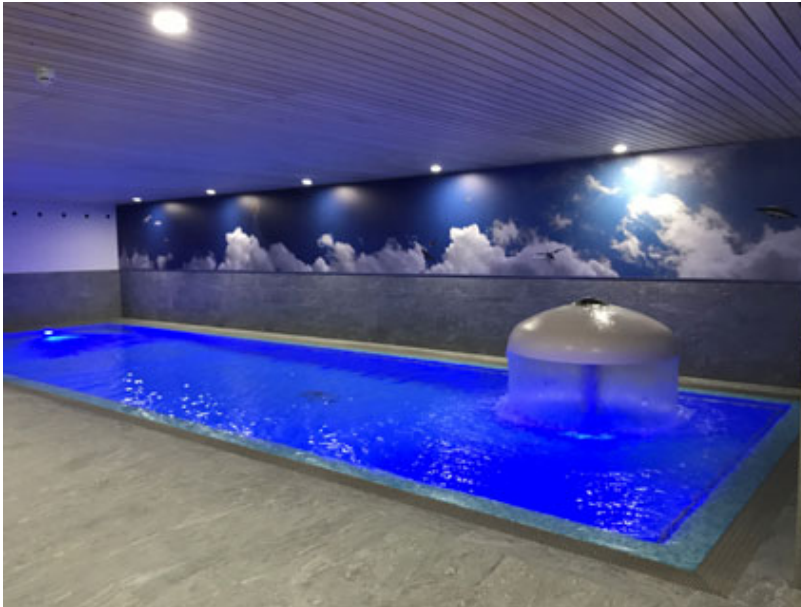
Fig. 10 and Fig. 11: The wellness area with three swimming pools and various saunas allows guests to relax in an area of over 2,500 square metres.