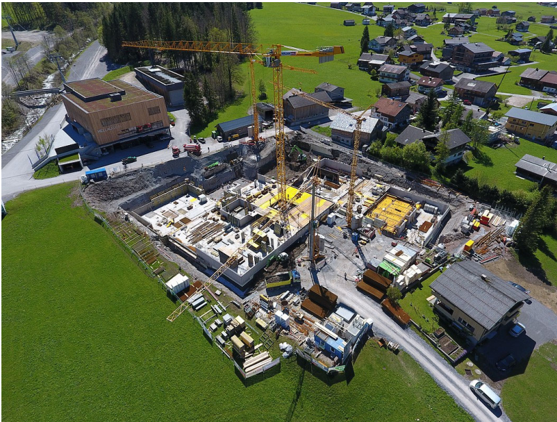
Fig. 1: A major construction site in Mellau: the hotel “Die Wälderin” with about 250 beds and a spacious wellness area. The owner, the architect and the contractor Fliesenpool GmbH in Nenzing opted for PCI Augsburg GmbH as their construction materials partner for tiling and mosaic laying. The leading manufacturer of construction chemical products supplied the appropriate products as well as providing advice and support during construction.