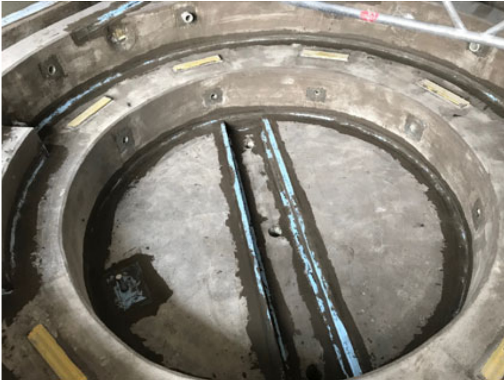
Fig. 5: The craftsmen used PCI Pecitape to seal critical points such as connections.