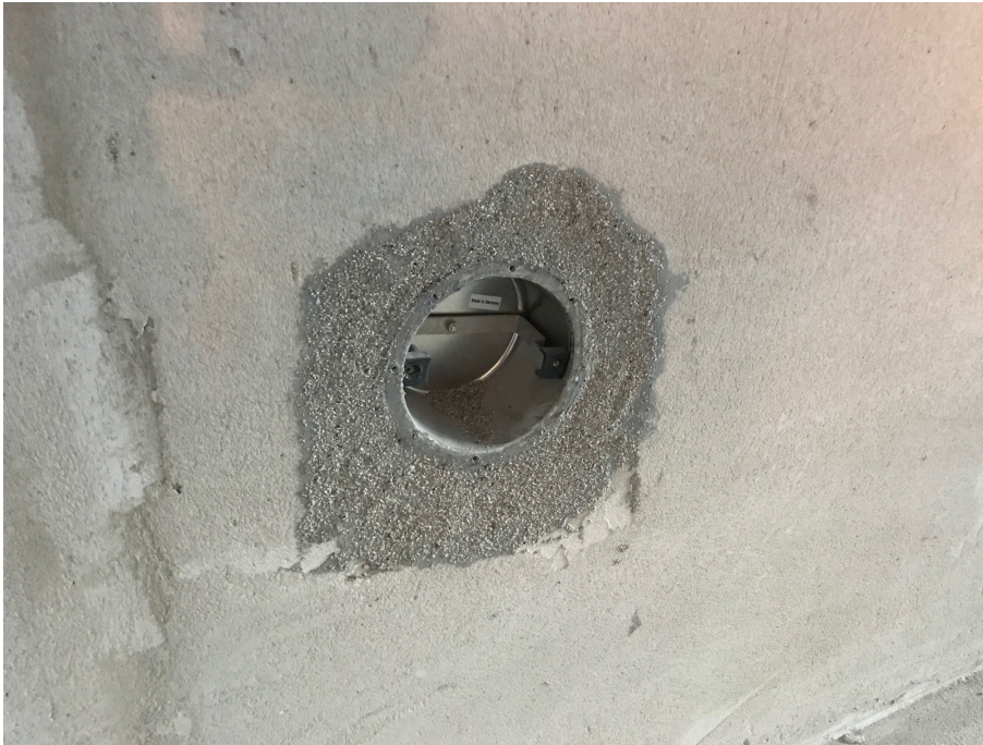
Fig. 4 (with flange)