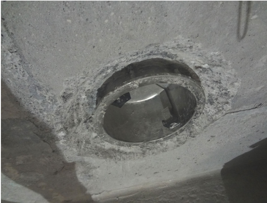
Fig. 3 (without flange)