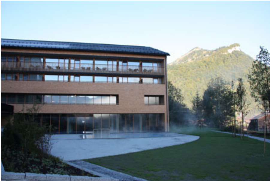
Fig. 8 and Fig. 9: Following 18 months of construction with an investment of about €28 million, the modern hotel “Die Wälderin” in Mellau opened in September 2018.