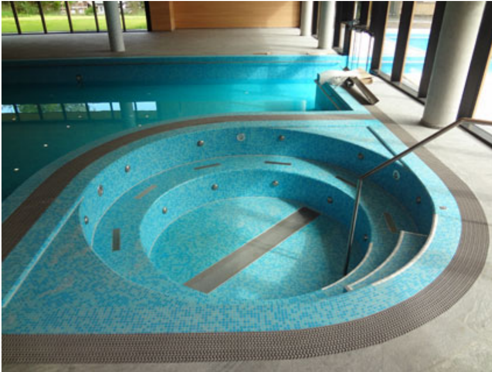
Fig. 6: The waterproofing of the whirlpool proved to be especially complex. About 30 components had to be integrated into the waterproofing.