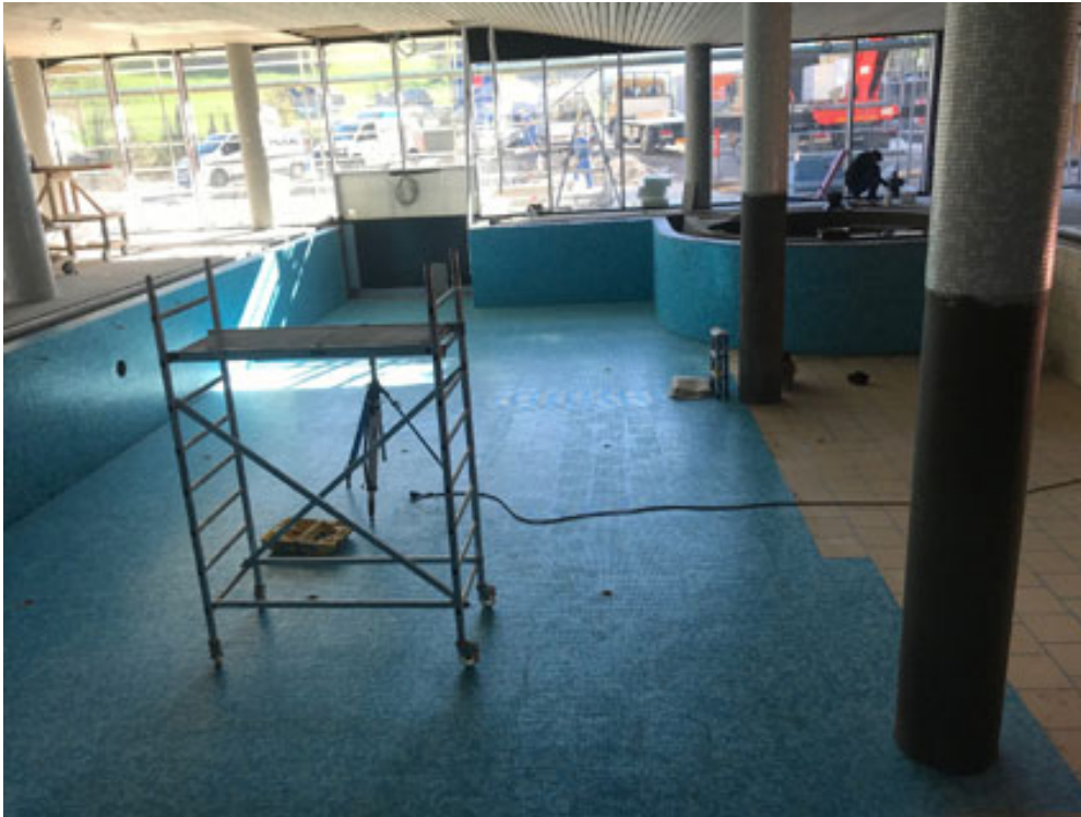
Fig. 2: The three swimming pools were constructed using waterproof concrete with appropriate additives and equipped with a second waterproofing layer of PCI Seccoral 2K Rapid. The fast-setting waterproofing slurry offers durable security and waterproofing thanks to its crack-free hardening and its isolating and stress-reducing properties.